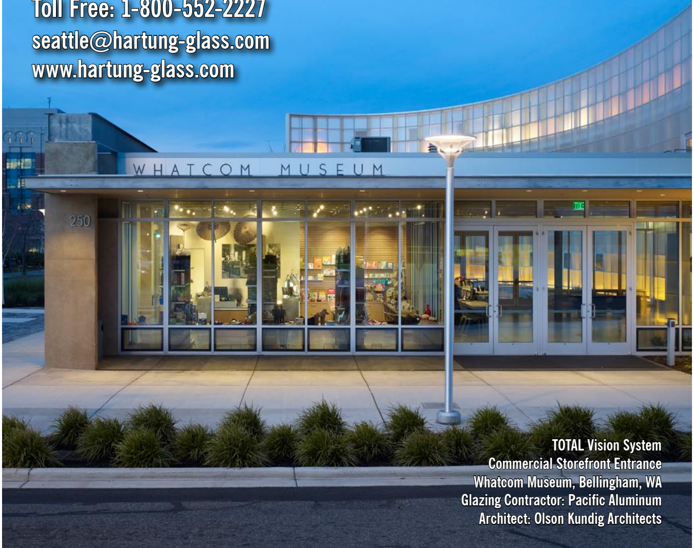
TOTAL Vision System Commercial Storefront Entrance Whatcom Museum, Bellingham, WA Glazing Contractor: Pacific Aluminum Architect: Olson Kundig Architects